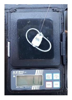
Funded by Deutsche Ornithologen-Gesellschaft und OAG Schleswig-Holstein und Hamburg